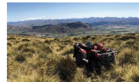
1 View from the Ski Hut

Our location is pretty breathtaking, so while you're peddling or walking take a moment for a breather and appreciate the amazing scenery. There are plenty of spots to stop and take photos but we've marked a few of our favourites in the map above. Come up to Welcome Rock and find your favourite view. Don't forget to share #welcomerocknz