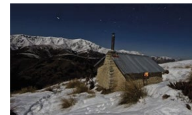
4 The Mud Hut