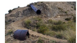
5 The Flumings