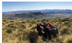
1 View from the Ski Hut

Our location is pretty breathtaking, so while you're peddling or walking take a moment for a breather and appreciate the amazing scenery. There are plenty of spots to stop and take photos but we've marked a few of our favourites in the map above. Come up to Welcome Rock and find your favourite view. Don't forget to share #welcomerocknz