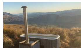
3 View from the Slate Hut