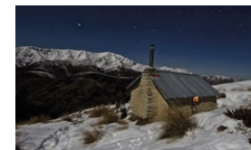
4 The Mud Hut