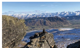
2 The famous Welcome Rock