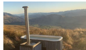
3 View from the Slate Hut