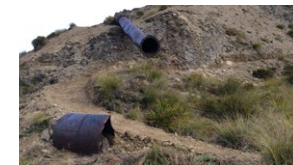
5 The Flumings