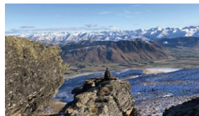
2 The famous Welcome Rock