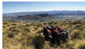
1 View from the Ski Hut

Our location is pretty breathtaking, so while you're peddling or walking take a moment for a breather and appreciate the amazing scenery. There are plenty of spots to stop and take photos but we've marked a few of our favourites in the map above. Come up to Welcome Rock and find your favourite view. Don't forget to share #welcomerocknz