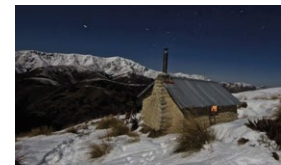
4 The Mud Hut